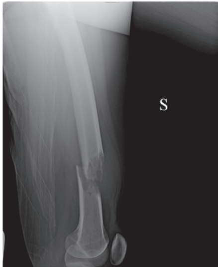
Figure 1. Osteolytic lesion on the distal third of the left femur diaphysis.