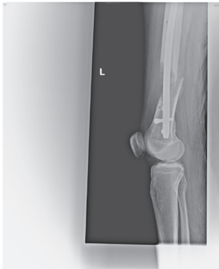
Figure 2. An intramedullary nail was placed for definitive treatment of the femoral fracture following delivery.