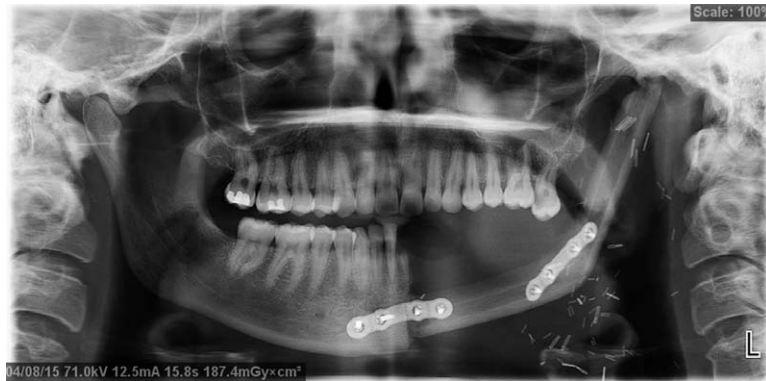
Fig. 3. Panoramic X-ray image. Five-month follow-up x-ray image shows stability of patient's bony fibular reconstruction.

and therefore was left intact and removed en bloc. Figure 2 shows the gross specimen. The hemimandibulectomy was well tolerated and reconstruction followed.