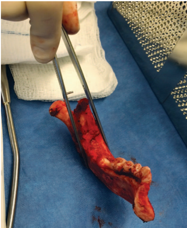
Fig. 2. Gross pathological specimens. Sagittal view of the thickened ramus.

Surgical resection of the mandible required a modified apron incision from the mastoid process extending to a lip-split incision between the lower 2 central incisors. The marginal mandibular nerve and facial artery were identified and preserved. Several enlarged perifacial and external-jugular lymph nodes were removed and sent for pathology. Dissection was carried out from the midline symphysis to the left glenoid fossa, encompassing the entirety of the left mandible. The disk of the temporomandibular joint was sclerosed to the head of the condyle