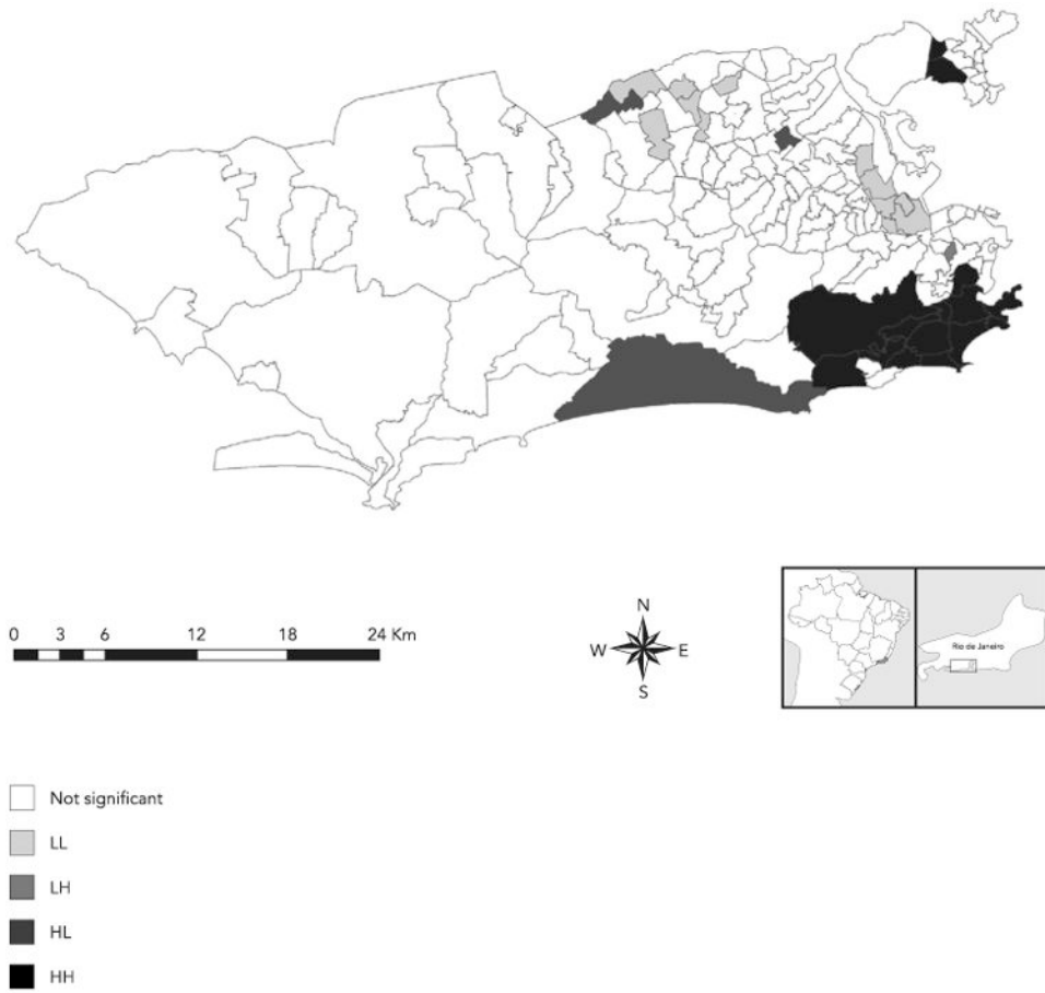
Figure 3. Map displaying the local autocorrelation (Local Moran Index) for the ward-level Urban Health Index (UHI) values, Rio de Janeiro, Brazil, 2010, with statistically significant clusters of high index wards (HH) and low index wards (LL).