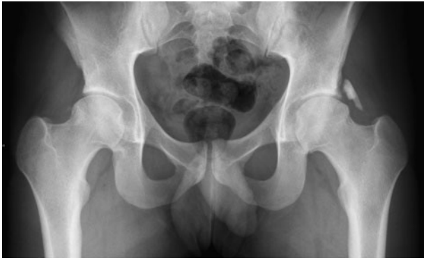
Fig. 2. Follow up radiograph of a 20-year-old patient after bilateral hip arthroscopy. The radiograph was taken 9 months status post left and 3 months status post right hip arthroscopy. HO on the left side was evident on radiographs 10 weeks after the index procedure. NSAID prophylaxis using etodolac 600 mg once daily for 2 weeks was administered only after the operation on the right hip.

mature. Although both plain radiographs and CT imaging are the standard references used to assess HO maturity, CT and 3D CT more accurately define the different stages of ossification than plain radiographs. In the case of revision surgery for the removal of HO, CT is essential for surgical planning and visualizing the shape and spatial location of the ectopic bone [39] (Fig. 3). Magnetic resonance imaging is typically not used in the diagnosis and assessment of HO. The signal intensity characteristics of pelvic HO change in various stages of HO maturation. With progressive maturity of HO, T2 signal intensity and contrast enhancement decrease but fat and cortical bone-equivalent signal intensity increase [40].