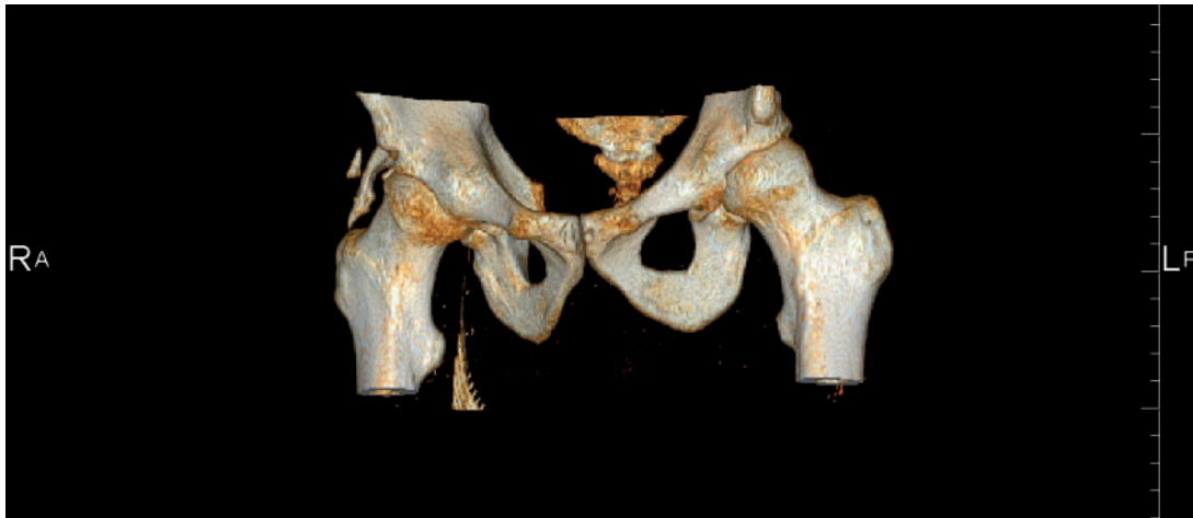
Fig. 3. 3D CT reconstruction of a 34-year-old triathlete showing grade 3 HO with acetabular origin and posterolateral location of the HO.

Specifically targeting this isoform in prophylactic treatment of inflammatory conditions may be advantageous as it avoids many of the adverse side effects attributed to the simultaneous COX-1 and COX-2 inhibition by non-selective NSAIDs [54].