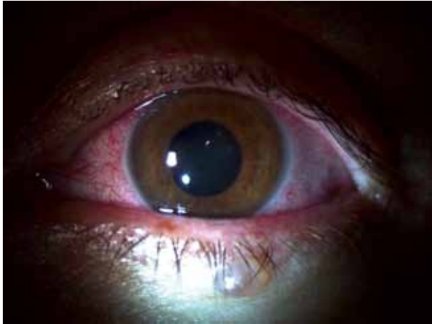
Figure 1. Slit lamp examination of the left eye of a physician from the United States who contracted Ebola virus disease in Liberia and had eye inflammation develop during convalescence. Image shows diffuse conjunctival injection, mild corneal edema with fine inferior keratic precipitates, fibrin reaction, and leukocytes in the anterior chamber without hypopyon. Used with permission of the patient.

tomography imaging showed cystoid macular edema and vitreous adhesions tethered to the optic disc.