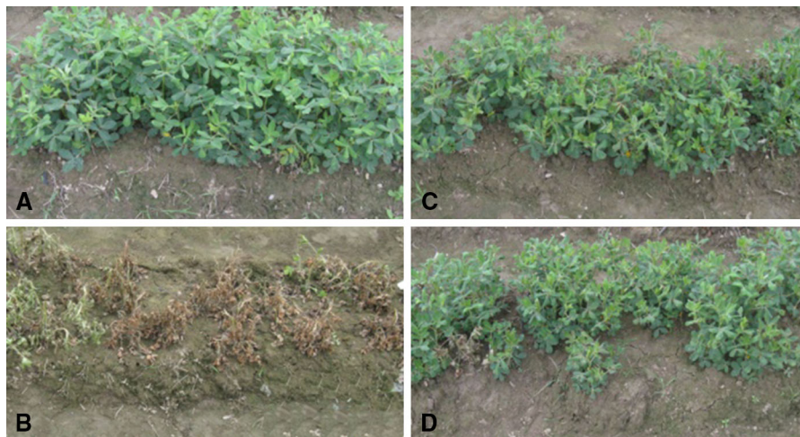
Fig. 1 Phenotypes of resistant and susceptible parents with or without inoculation of R. solanacearum . a Phenotype of susceptible parent Xinhuixiaoli without inoculation of Rs. b Phenotype of susceptible parent Xinhuixiaoli inoculated with

A highly virulent strain of R. solanacearum Rs-, viz P.362200, was used to evaluate the resistance to bacterial wilt in the cultivated peanut by the leaf-cutting method. Two parental lines, Yueyou 92 and Xinhuixiaoli, clearly displayed differential reactions to the inoculation with the pathogen. Loss of leaf color or yellowing of leaves was observed in Xinhuixiaoli within a few dai. Wilt symptoms developed rapidly in the cut leaves, spread to uncut leaves, and subsequently spread to leaves of other branches, leading to whole plant wilt or death in 15–25 dai. Yueyou 92 showed no apparent symptoms or very little wilt in the cut leaves (Fig. 1). The control parental plants,