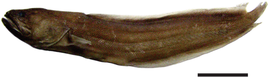
Figure 3. Ogilbia ventralis . LEMA-PE135, ♂, 56 mm SL, Pacific Mexico, Bahía Chamela. Scale 10 mm.

of this nominal species is the TEP (Rocha et al. 2008). Future review of other species that reportedly occur in both oceans is important to define valid distributions. Finally, according to Robertson and Cramer (2009), the fish richness of Bahía Chamela is most similar to that of the Panama biogeographic province, but there is an important contribution of species from the Gulf of California and outer Baja peninsula and a few species from other oceans.