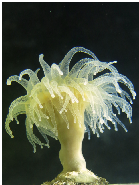
Figure 1 The cold-water coral Desmophyllum dianthus .

reveal whether corals are mainly metabolizing proteins, carbohydrates or lipids, giving a further indication of coral stress under the experimental conditions.