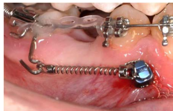
Fig. 2 An orthodontic mini-implant* immediately after insertion and orthodontic loading. *Quattro implants PSM Medical Solutions; Tuttlingen, Germany

However, surveys in a variety of countries have shown that many orthodontists never or rarely use these devices [6–9, 18]. This KTA gap is a surprise for a technique that was introduced almost 20 years ago and that has the advantageous characteristics described previously [11–13, 16].