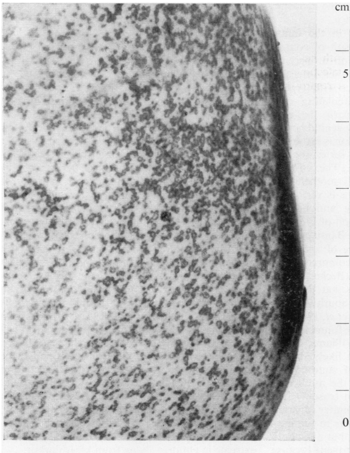
Fig. 2 Surface of the liver (case 6) showing how sharply the areas of necrosis and haemorrhage stand out in the fatty background ( \times 1.6 ).