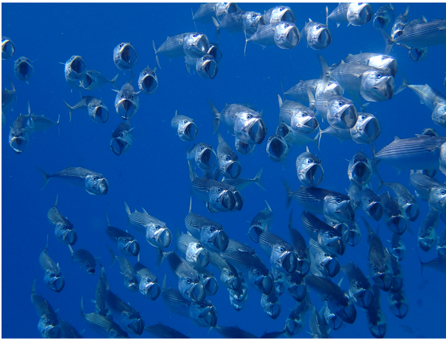
Figure 1. A shoal of fish in the Red Sea. How did collective motion, such as the movement of a school of fish, first evolve? And what do the individuals within the group gain from this collective behaviour? Hein et al. have developed a model based on individuals and groups searching for resources. This model reveals a number of emergent properties that allow groups to find resources more quickly than individuals working alone.

each individual in the model has a rather primitive ability to sense these resources. As such, the model describes fairly simple behaviours whereby each individual reacts to neighbours within a certain range and slows down in a resource-rich environment. The model is also set up such that individuals that spend more time in resource-rich patches produce more offspring; this allows more efficient foragers to outcompete the less efficient ones and take over the population.