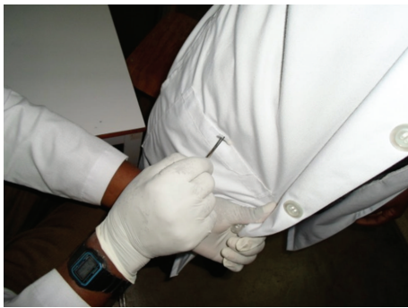
FIGURE 2: Techniques for swabbing white coats.

working in inpatients settings [5]. The staphylococci species are the most organisms isolated by every researcher especially Staphylococcus aureus [1]. It seems that Staphylococcus aureus was the common organism found in each study even in KCMC Hospital, Moshi, Tanzania, whereby the current study supported the previous findings.