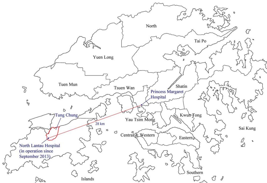
Figure 1 Map of Hong Kong showing the location of Tung Chung and location of available healthcare services for Tung Chung residents. According to the 2011 census, around 78 000 residents were living in Tung Chung new town. To satisfy the shelter demands, three public housing estates, Fu Tung Estate, Yat Tung (I) Estate and Yat Tung (II) Estate, have been established to provide more than 13 000 residential units to Tung Chung residents. However, since it is located on the north-western coast of Lantau Island in Hong Kong, a minimum of 45 minutes travelling time using the Mass Transit Railway (MTR) metro system is required for residents to travel to Hong Kong's business centre in Central, other commercial centres or the nearest regional hospital with full medical services (the Princess Margaret Hospital). (The map was drawn using the software R V.3.1.1.).

recruited from various Hong Kong subdistricts for comparison. Control families will not be invited to join our Health Empowerment Programme; nevertheless, a comprehensive health assessment will be provided at the beginning and end of the programme for collecting various health variables.