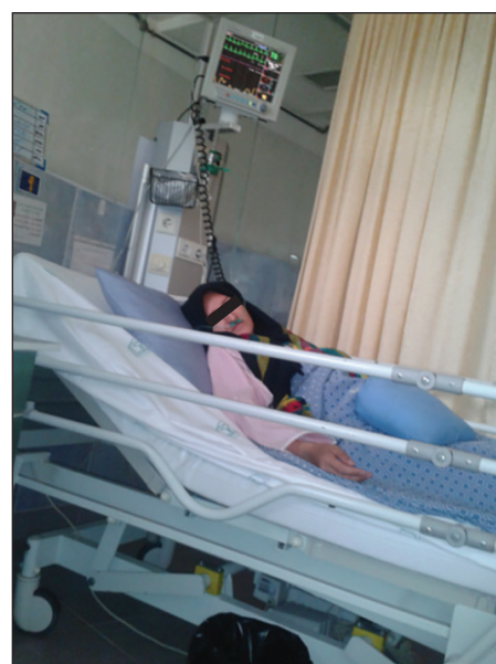
Figure 1: Recording the signal in 45°

Also, among of the various groups, the pain variables, ambient temperature, percent of blood oxygen saturation, blood pressure, respiratory rate, and heart rate were evaluated. Table 2 shows the mean and standard deviation of the variables in five angles of the bed. By changing the angle of the bed, the mean pain, heart rate, systolic blood pressure, and respiratory rate changed significantly ( P < 0.05 ) but the temperature variation, blood oxygen saturation, and diastolic blood pressure in subjects were not significant ( P > 0.05 ). Figure 1 shows the recording of signal for a subject in 45° angle. Figure 2 shows the relationship between pain, heart rate, systolic blood pressure, and respiratory rate with the angle of the bed. The relationship between the variables and angle changed nonlinearly. A significant reduction was observed in pain, respiratory rate, heart rate, and