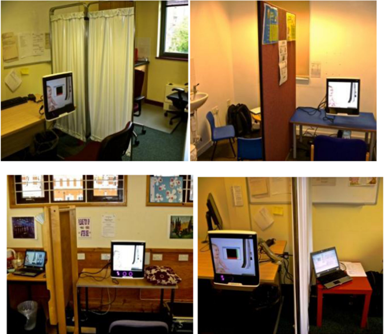
Figure 3. Photographs of differing set-ups in four CCs.