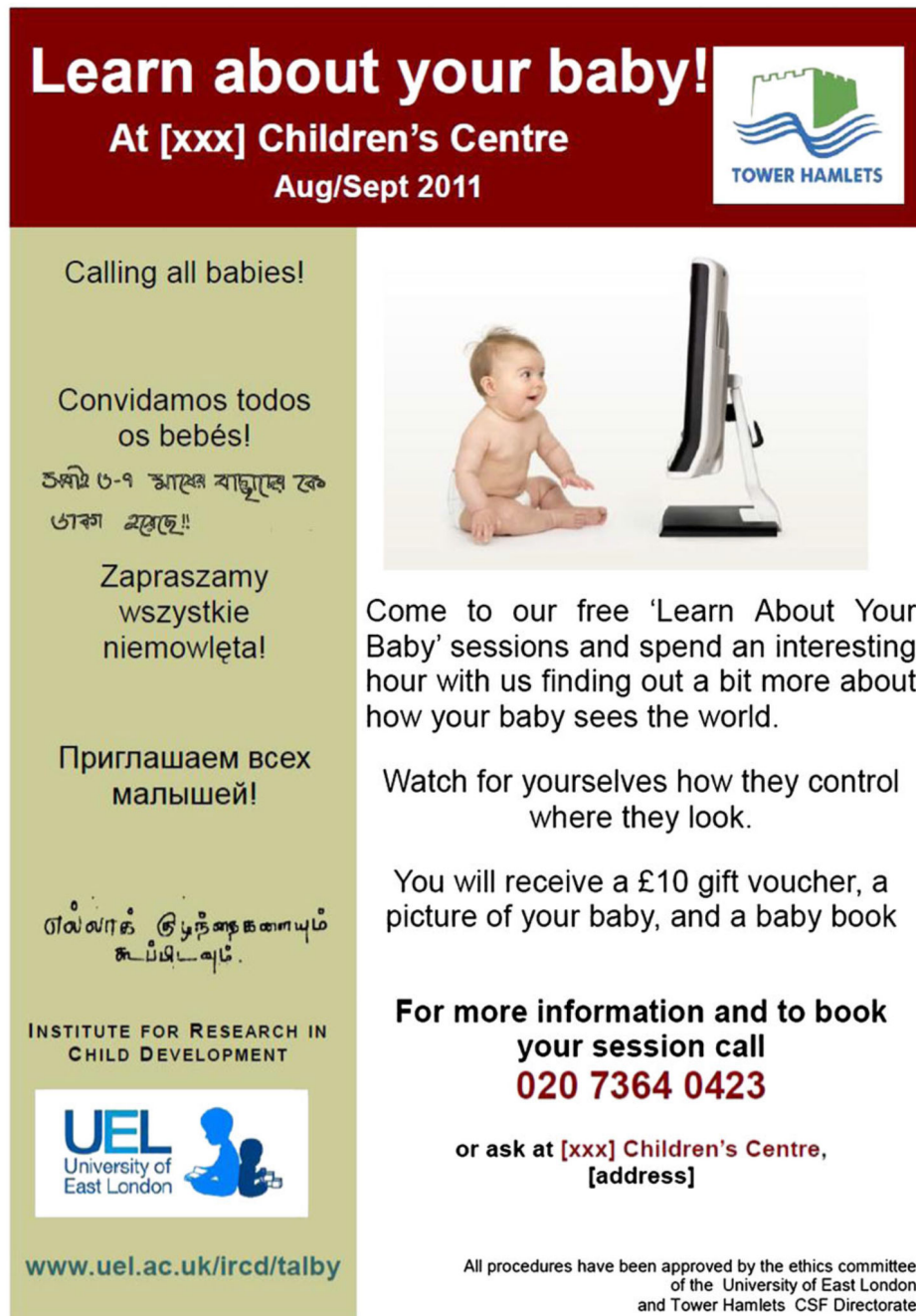
Figure 1. Poster used for recruitment in Tower Hamlets local authority centres.