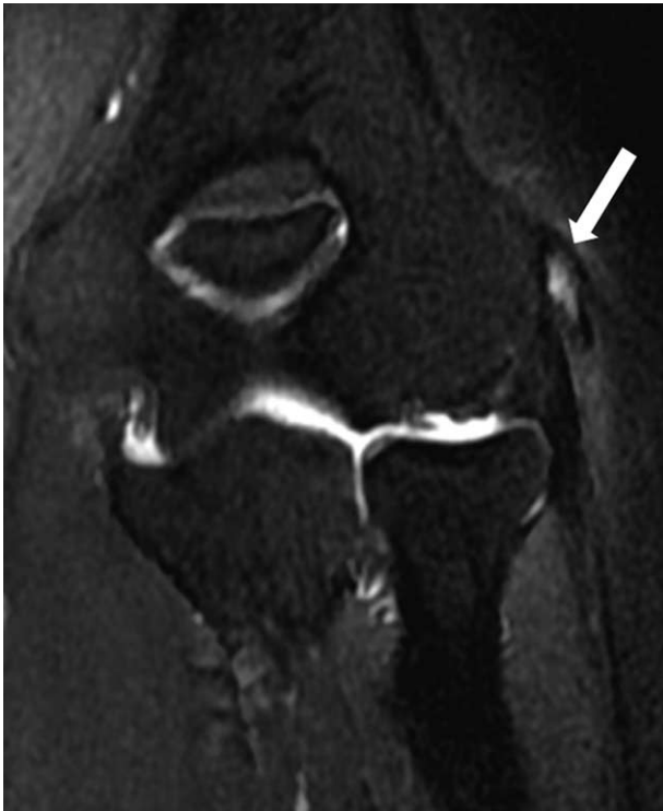
FIGURE 2. 54-year-old man with left elbow pain ~1.6 years (Tendinopathy score = 2; PRTEE score = 57). Coronal T2-weighted fat-suppressed MR image shows moderate focal increased signal in tendon (white arrow). PRTEE = Patient-Rated Tennis Elbow Evaluation.