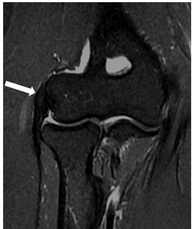
FIGURE 1. 40-year-old man with right elbow pain ~7 months (Tendinopathy score = 1; PRTEE score = 28). Coronal T2-weighted fat-suppressed MR image shows a mild focal increased tendon signal (white arrow). PRTEE = Patient-Rated Tennis Elbow Evaluation.

The median PRTEE score of all patients was 61 (range 8–98), the median PRTEE score of tendinopathy score 1 was 21,