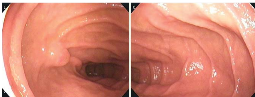
Fig. 1 Visualization of the 2nd portion of the duodenum on two video monitors with a clear view of Vater's papilla.