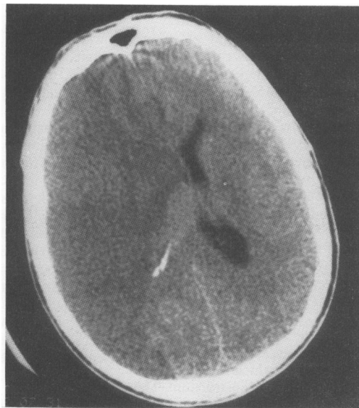
Figure 2 Computed tomographic scan of the brain showing right cerebral infarction with oedema.

remainder underwent resection. Three cases came from the same institution and were the only torsions seen in a group of 1380 lobectomies (0.2%). 3 Only one other case of cerebral infarction complicating pulmonary torsion has been reported. 4 In this case torsion of the upper lobe occurred after left lower lobectomy for a carcinoid tumour in a Japanese patient. Repeat thoracotomy was performed and showed a 180° rotation of the upper lobe; the torsion corrected without resection. Afterwards the patient developed a right hemiplegia with left cerebral infarction visible on the CT brain scan. Emboli from a thrombus in the pulmonary vein were thought to be responsible for the cerebral infarction. The same is true for our case where emboli were also found in the renal artery on post mortem examination.