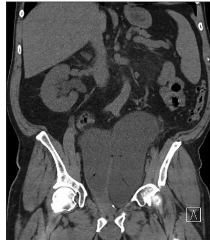
Figure 1: Vertical section of the computed tomography abdomen and pelvis showing the distended bladder (solid arrow head), with diverticula (open arrow), diverticular mouth (double arrow) and right kidney hydronephrosis