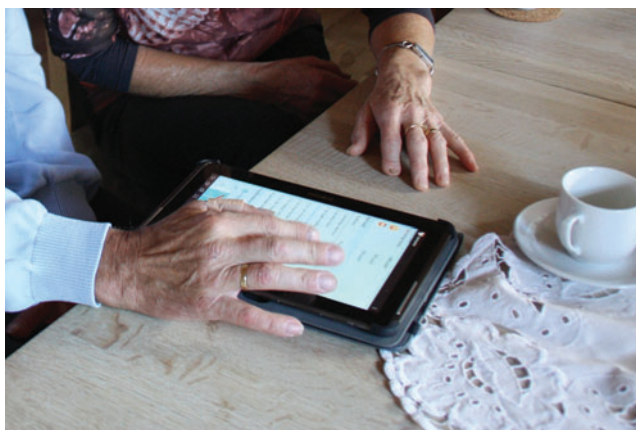
FIG. 3. A patient and his wife using “The Heart Game” on a tablet computer. (Color images available at www.liebertonline.com/g4h )