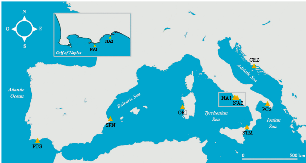
Fig 1. Map of sampling localities. Eight geographic samples were collected across the Mediterranean Sea and the Atlantic Ocean. See Table 1 for geographic coordinates and other information.