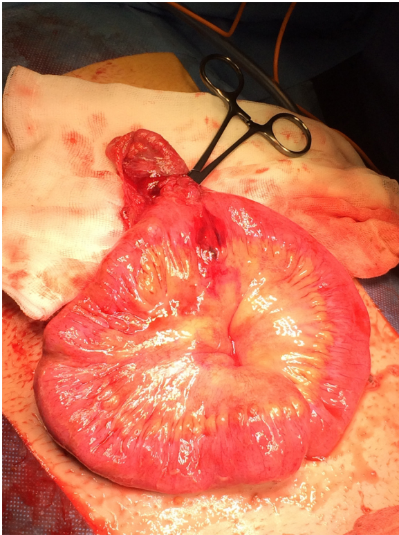
Fig. 1. Perioperative image of Meckel's diverticulum.