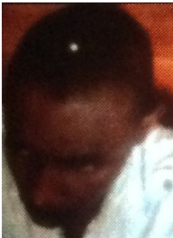
Fig. 1. A picture of the mentally challenged young man showing a visible nail head on his head.

problem. The plan was to extract the nail surgically. An informed consent was obtained and under sedation and local anaesthetic infiltration, a 6 cm curved incision was made across the nail head to raise a scalp flap. A small burr hole was created adjoining the nail to widen the interphase between it and the skull. When this was done, the nail became loose and with a forceps, the nail head was held and pulled out very slowly and gently. The field was dry and the only bleeding was from the scalp wound. The nail was rusted already except for the head (Fig. 4). The edge of the skull at the point of penetration was curetted and the track was irrigated copiously but gently with normal saline from a 10 ml syringe. The opening in the skull was covered by advancing the pericranium over it, while the wound was debrided and partially closed. Postoperative care was administered. Broad spectrum antibiotics was administered for 10 days. He was also given prophylaxis for seizures. The patient recovered uneventfully, and he was discharged on the fifth postoperative day. He was sent to the out-patient department for dressing. The wound healed by the third week and the limb weakness recovered completely by the end of the fourth month. The patient was referred to a special school for people with learning disabilities. He was also seen by the psychiatrist during one of the check-visits who concluded he had learning disability.