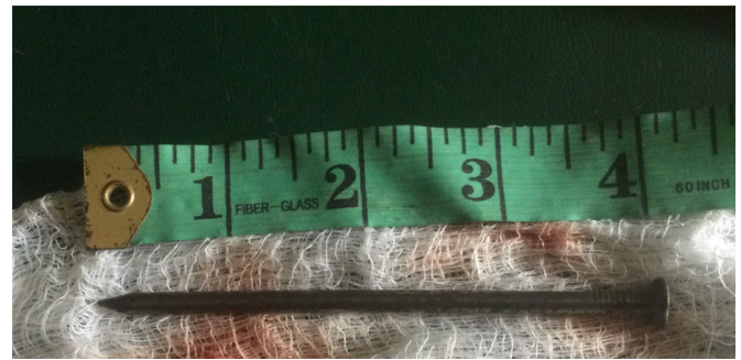
Fig. 4. Showing a picture of the 4 in. impaled nail after extraction.

for monitoring where possible, with follow up CT scans especially without the metal artefact or with angiography [4,9,10]. Their unaffordability and unavailability made reliance on clinical assessment and radiography the only diagnostic workup and postoperative follow-up of our patient. In a poor resource setting like ours, the challenges in managing this patient were enormous and the solutions may not have been by just referring the patient to a faraway neurosurgical centre but in ensuring that the patient got to the referral centre. In this patient as in many other cases, this was not possible and so we were committed to managing our resources well enough to provide this specialized care for the patient. The traditional Hudson brace and burr drill bits were the only armamentaria available to us.