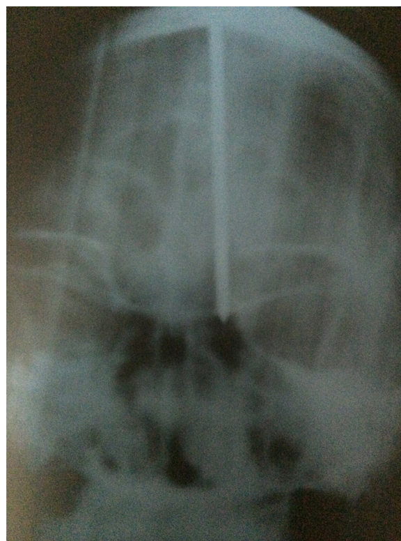
Fig. 2. Antero-posterior plain radiograph of the skull showing impaled nail in the brain.

Nail impalement injury to the brain is a rare neurosurgical emergency. It may occur as a result of construction site accidents and accidental falls into shrapnel or as a result of bomb blasts. Construction workers that use nail guns can sustain impalement injuries when the gun misfires, driving nails into the body [1,2]. There are reports of intentional use of nail gun for attempted suicide [3]. This case is probably the first self-inflicted nail impalement injury to the brain by a mentally challenged person, reported in