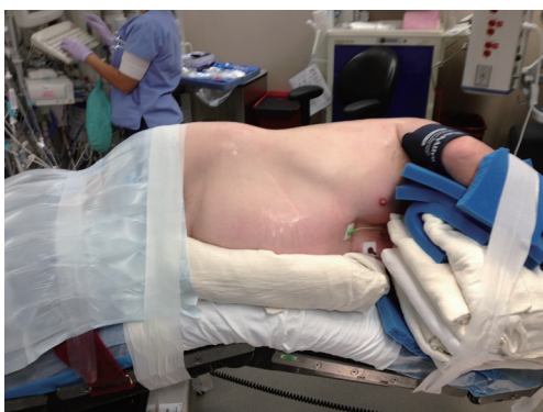
Figure 2 Anterior view of lateral decubitus positioning.