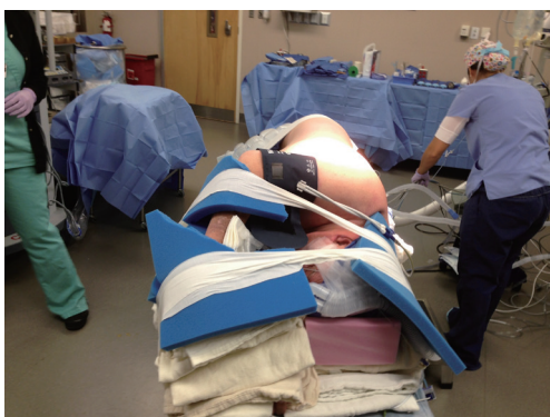
Figure 1 Lateral decubitus patient positioning.