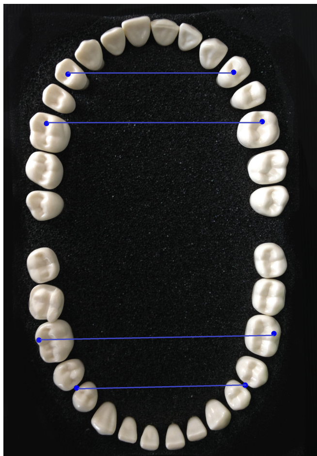
Figure 1. Landmarks used for measurements in maxillae (on top) and mandible (on bottom).