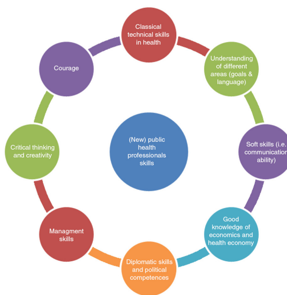
Fig. 1. (New) public health professionals’ skills.

Public health people can, and should, fill a variety of roles. Some will be involved in research and monitoring, others will be involved in policy development, others in implementation. Sometimes these skills may all be embodied in one person, but they need not be