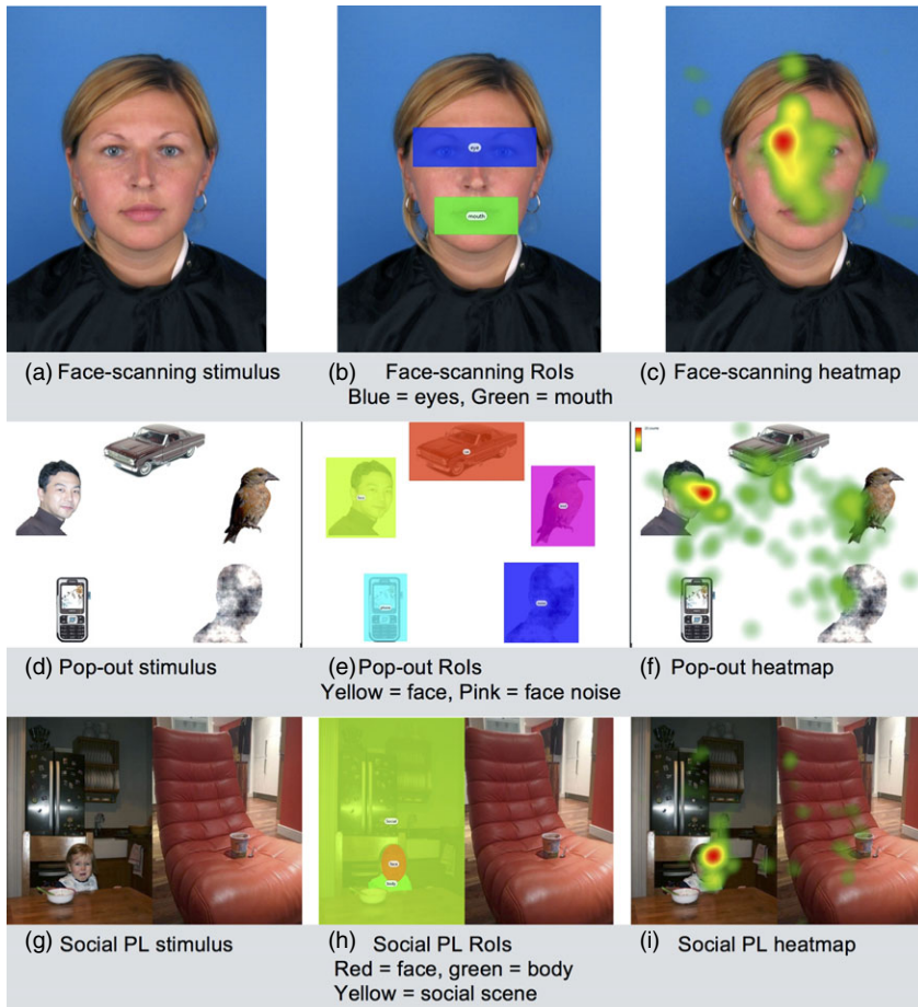
Figure 1 Sample stimuli, regions of interest and heatmaps for the face-scanning task (a–c), the pop-out task (d–f), and the social preferential looking task (g–i). This panel shows example stimuli for each task. We have written consent from adults, and from the parents of children, shown in these images.

& Findlay, 2009) using a smaller set of images and featuring children instead of adults. The stimuli were 12 pairs of photographs of real-world scenes (see Figure 1). Each pair contained a social scene (depicting one or two children) and a nonsocial scene (depicting no people). Stimuli were created for this study by taking photographs of everyday scenes both with and without children—thus, each photograph is partnered with a “control” photograph of the same location, but without people. When creating the stimuli used in this study, photographs were shuffled such that each