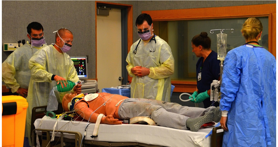
FIGURE 2: Trauma boot camp

Interns managing a simulated trauma patient during a one day trauma boot camp