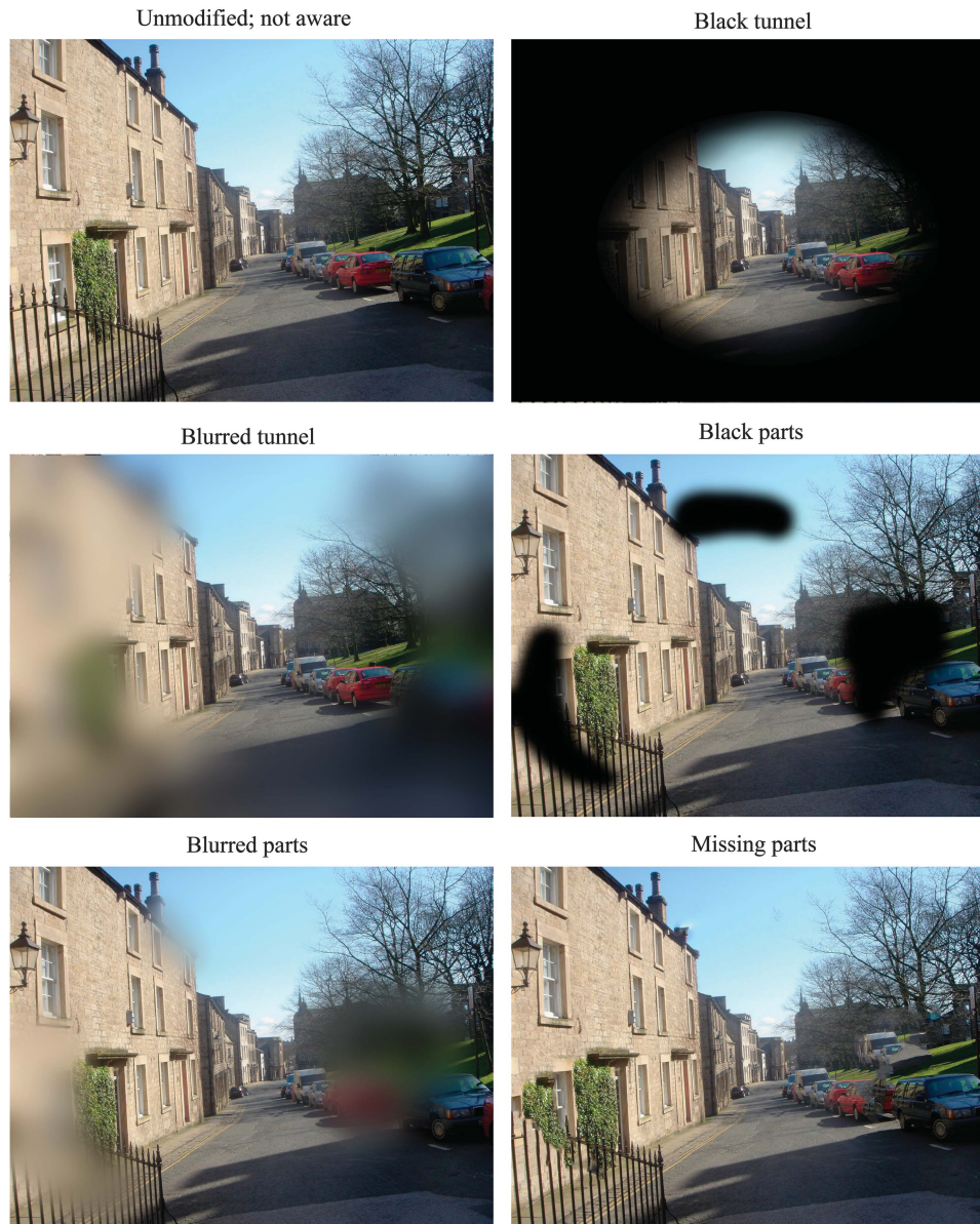
Figure 2 Six images were shown to 50 patients with bilateral visual field defects. For all six, the same outdoor scene image was used but each was manipulated to provide views of the image obscured and degraded in a range of distinct ways. None of the 50 participants in this study chose the image altered to have ‘a tunnel with black edges’ effect or the image with ‘black patches’. Thirteen participants (26%) were completely unaware of their VF defect affecting their visual function, choosing the original unedited image. Twenty-seven (54%) and eight (16%) participants chose the images with ‘blurred patches’ and ‘missing patches’, respectively. The ‘missing patches’ is a very subtle but potentially realistic effect (see the red car) because we used a photograph filling tool to replace the missing parts with the background. Only two participants chose the image with a ‘tunnel with blurred edges’ (4%).

describe what they ‘see’. 65 We also asked patients, all of whom had visual field loss in both eyes, to choose a picture that best depicted their visual symptoms (Figure 2). Unsurprisingly, no patients chose images with black patches or the ‘black tunnel’, with many eloquently describing how parts of their field-of-view are missing or are distorted with a ‘blur’ (Figure 3a). It was particularly striking that one in four of these patients reported no symptoms whatsoever even