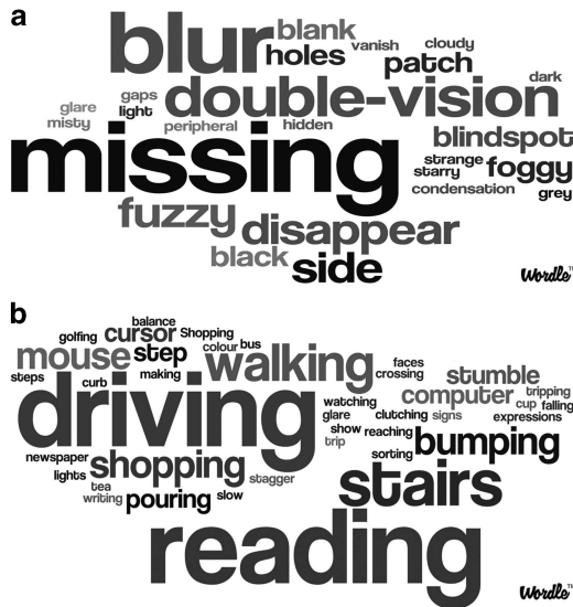
Figure 3 A word cloud showing the occurrence of descriptors of glaucomatous vision loss calculated as the number of participants who used the term (a). The size of a word in the visualisation is proportional to the frequency of its use. Similarly, a word cloud of named everyday activities where visual field loss was noticed by an individual is shown in b.

though they had bilateral VF loss, with most having at least moderate damage in their better eye. Patients also described the activities during which they noticed their impairment; these interviews were subjected to a type