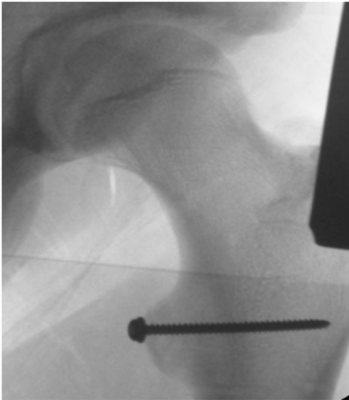
Figure 7. Cancellous screw fixation.

oral analgesics. We did not use any form of casting or bracing. Crutch weight bearing commenced immediately, the day following the surgery. Plain radiographs were taken on the day after surgery and showed excellent alignment. Weight bearing as tolerated with crutches was advised for a period of 4 weeks with precautions to avoid active flexion and no straight leg raise. Physiotherapy to strengthen their hip flexors was started following this period. All the patients were allowed to resume sporting activity 10–12 weeks after surgery. All the patients were reviewed 2, 6 and 10 weeks later. At every follow-up, they were