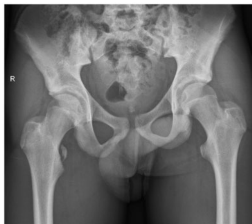
Figure 2. Plain radiograph showing an avulsion of the right lesser trochanter.

the ability to flex the hip and to walk upstairs in normal sequence.