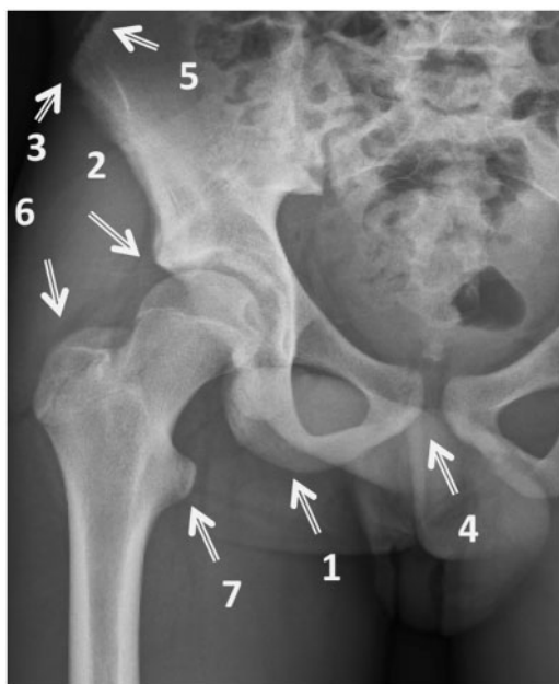
Figure 1. Sites for avulsion injuries in the pelvis and proximal femur. [10].

the common injuries [4, 8, 10, 11]. Avulsion fractures of the lesser trochanter, greater trochanter and iliac crest are rare injuries [4, 5, 8, 10, 11]. Isolated avulsion fractures of the lesser trochanter represent <1% of hip injuries in the orthopaedic surgeon's practice [4].