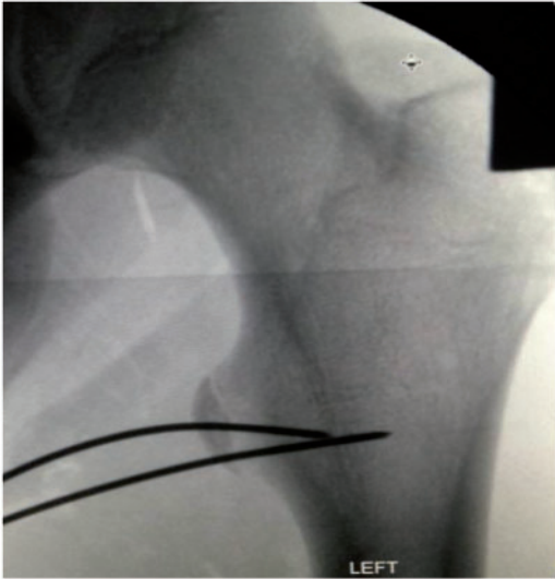
Figure 6. K-wire used to hold fragment in situ .