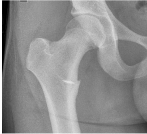
Figure 8. Fixation using a suture anchor.

oral analgesics. We did not use any form of casting or bracing. Crutch weight bearing commenced immediately, the day following the surgery. Plain radiographs were taken on the day after surgery and showed excellent alignment. Weight bearing as tolerated with crutches was advised for a period of 4 weeks with precautions to avoid active flexion and no straight leg raise. Physiotherapy to strengthen their hip flexors was started following this period. All the patients were allowed to resume sporting activity 10–12 weeks after surgery. All the patients were reviewed 2, 6 and 10 weeks later. At every follow-up, they were