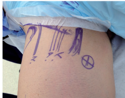
Figure 5. Medial portals used for hip arthroscopy.

into near anatomical position and held in situ with K-wires. The position of the reduction was then checked with an image intensifier (Fig. 6). A cannulated screw was passed over the most vertical wire holding the fracture in place in two of the cases while a 5.5-mm anchor was used to secure the chronic fragment due to its small size. There was no evidence of any heterotrophic ossification around the fragment. The insertion of the wires, screws and anchor was done through the medial portal, which lay directly against the lesser trochanter (Figs. 7 and 8). The wound was closed using single interrupted sutures (3-0 Monocryl) after local anaesthetic infiltration.