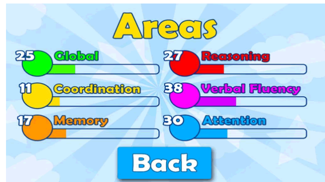
Figure 1. The cognitive areas treated with ADHD Trainer.

During the first month of cognitive training therapy, the patient was only allowed to play with specific games based on the TCT Method, using the "ADHD Trainer" (Figure 2). The patient had to use the app every day at the same time, provided the other targets that were assigned in therapy, such as the progressive reduction in