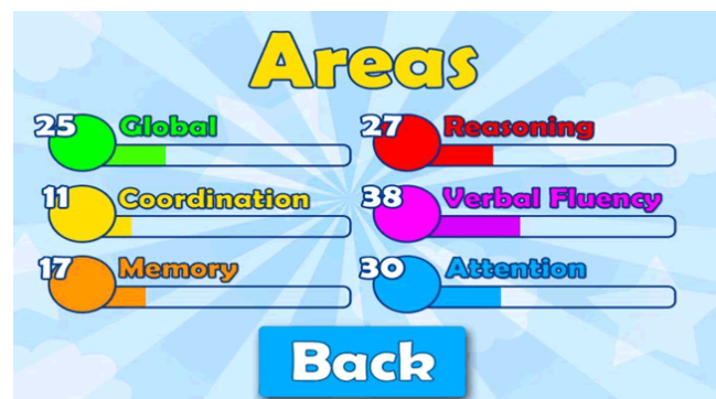
Figure 1. The cognitive areas treated with ADHD Trainer.

The TCT is a type of computer adaptive test (CAT), as it adapts to the individual's cognitive strengths and weaknesses, based on his own scores over time, as well as those of his peers. Users receive separate scores in different cognitive areas, including simple calculation, attention, perceptual reasoning, and visuomotor coordination (Figure 1). The goal of the daily training is to reach a pre-set individualized score in different cognitive domains, in order to complete a week of successful training. The exercises comprising "ADHD Trainer" are described in the following Table 1.