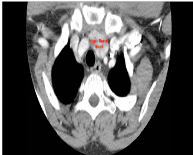
Figure 1. Image of CT-scan CT: computed tomography

Substernal goiter is the extension of thyroid gland in the mediastinum. If the thyroid tissue extends towards mediastinum it is defined as secondary and if there is ectopic thyroid gland in the mediastinum it is defined as primary. Primary substernal goiter constitutes 1% of all substernal goiters. Primary and secondary substernal goiters are fed respectively by mediastinal vessels and the vessels in the neck (5). Therefore, for the patients to be operated for substernal goiter, the differentiation of primary and secondary is clinically important. Ectopic thyroid tissue: anatomical, clinical, and surgical implications of a rare entity. In the literature there are very few cases related to mediastinal thyroid tissue detected after thyroidectomy, except the ones reported by Sahbaz et al. (6), Calò et al. (4) and Casadei et al. (7). Therefore, no incidence was reported in the literature regarding mediastinal thyroid tissue detected after thyroidectomy. However, retrosternal goiter incidence rates range between 0.2% and 45% of all goiters, depending on the definition used. About 20-40% of retrosternal goiters are symptomatic (6). Respiratory symptoms and rarely dysphagia or vena cava superior syndrome may be seen in some cases (2). No symptoms associated with retrosternal ectopic thyroid tissue were present in the patient in this case report. Retrosternal ectopic thyroid tissue was determined when there was no increase in TSH level