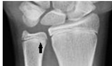
Fig. 3 Radiograph of the distal radius and ulna showing the R9 grade. Examiners should focus on the narrowing of the physis. In this radiograph, the ulna is graded U7 as there is narrowing of the medial physal plate (black arrow) but incomplete fusion.