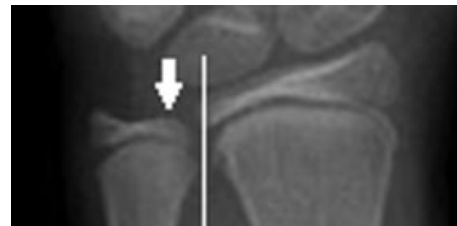
Fig. 4 Radiograph of the distal radius and ulna showing the U5 grade. Examiners should focus on the flattening of the radial epiphysis (white arrow) and should note that the epiphysis is not as wide as the metaphysis, indicated by the vertical white line touching the metaphysis but not the epiphysis.

thus we often relied on the appearance of the epiphysis being as wide as the metaphysis. To differentiate U7 (→ Fig. 3 ) from U8 (→ Fig. 5 ), we usually used narrowing of the medial ulnar physis (U7) and fusion of the medial ulnar physis (U8) as the determining factor. The descriptions of the smooth curve line articulation in U7 might not be very easily understood.