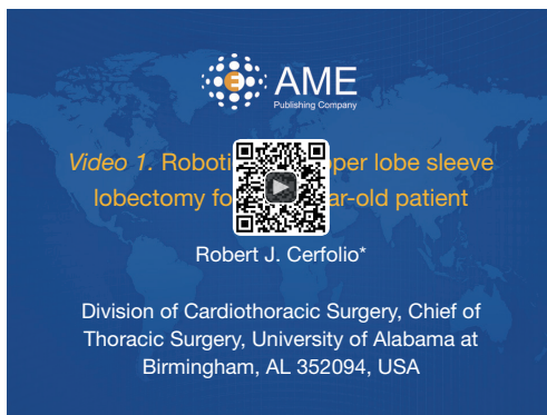
Figure 2 Robotic right upper lobe sleeve lobectomy for a 72-year-old patient (4).

Available online: http://www.asvide.com/articles/820