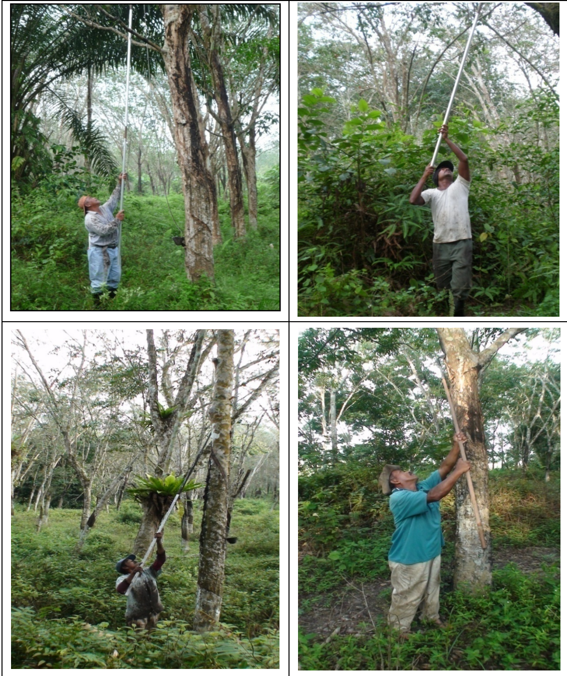
Figure 2. Neck flexion or rotation, awkward and static postures while conducting tapping process