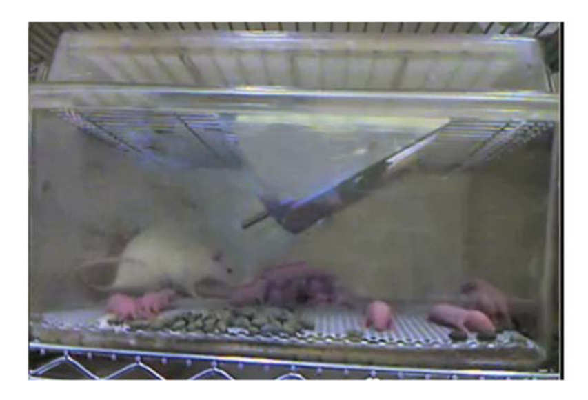
FIGURE 2. Photograph of a cage at the moment of onset of the limited bedding/nesting chronic early-life stress paradigm in rats. Note the fine, plastic-coated aluminium-mesh floor and the shredded paper towel. The cage is placed on a metal cart.