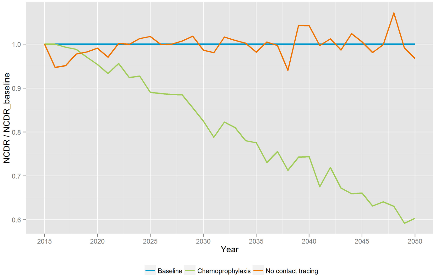
Fig 2. Predicted impact of two scenarios of future leprosy control: 1) discontinuation of contact tracing, and 2) contact tracing in combination with chemoprophylaxis. The figure presents the relative difference in new case detection rates in comparison with the prediction from the baseline scenario. Results are an average of 100 runs.