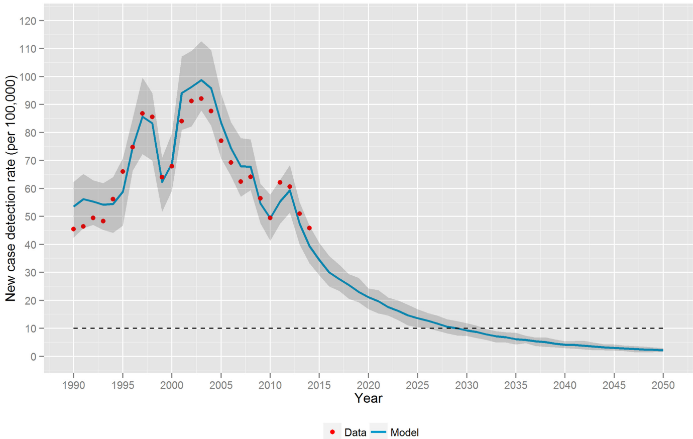
Fig 1. Projections of the new case detection rate in in Pará State, Brazil from 1990 to 2050. The model was able to fit the observed data (1990–2014). Results are the average of 100 runs. The shaded area represents the confidence interval (stochastic variation between individual runs).