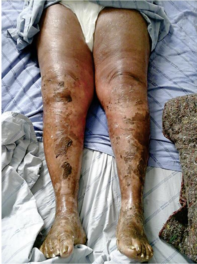
Fig. 1. Diffuse exfoliative lesions on the legs.

Guerreiro de Moura et al.: A Case of Acute Generalized Pustular Psoriasis of von Zumbusch Triggered by Hypocalcemia