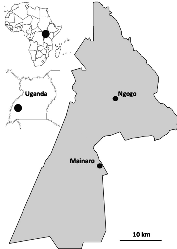
Figure 1: Map of Kibale National Park, Uganda.

Kibale National Park, Uganda (766 km 2 ) is a moist, evergreen medium-altitude forest with a mosaic of old-growth forest, swamp, grassland and regenerating forest of varying ages