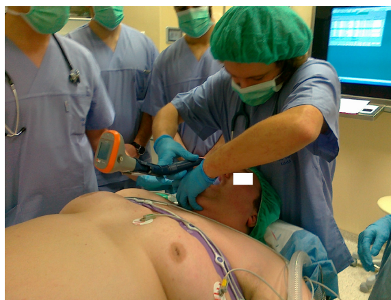
Figure 2 TotalTrack insertion.

In the MCL group, anesthesia was commenced the same way. After ensuring face mask ventilation, a muscle relaxant was administered and after achieving 100% muscle relaxation, intubation efforts were commenced. Visualization of the larynx was assessed by the CL scale.