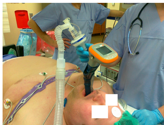
Figure 3 Ventilation through TotalTrack.

There was no difference between groups regarding demographic data (Table 1). Results of observation of ventilation and intubation possibilities are shown in Table 2. In the MCL group, all patients were intubated during the first attempt, but CL score was 2 in four cases, and 3 in three cases. In the TotalTrack group, CL score was 1 in 11/12 cases. In one case, ventilation was not effective because of a persistent leak, but fast intubation through TotalTrack