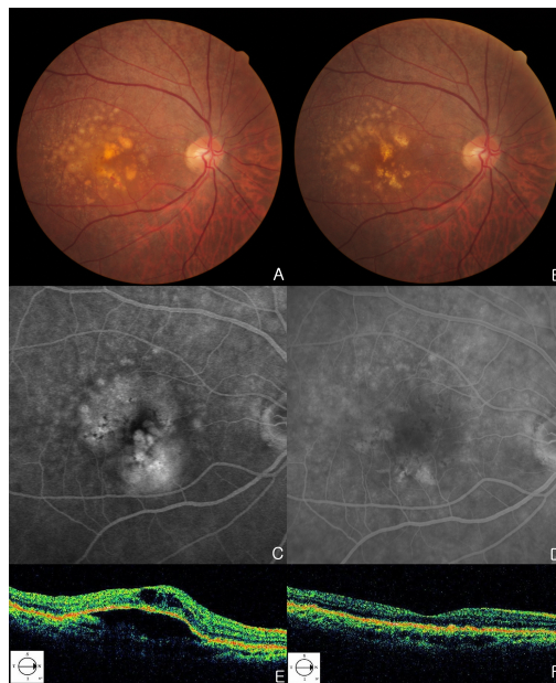
Fig. (1). (A, C, E) Fundus photographs (A), FFA (C) and OCT (E) images of patient at the first examination. Fundus photographs, a centrally located DPED are seen with diffuse coalesced soft drusen at right eye. Hyperfluorescence of FFA and hypo-reflectivity of OCT correspond to CNV with a DPED. (B, D, F) Fundus photographs (B), FFA (D) and OCT (F) images of patient after ranibizumab injections. After 5 intravitreal ranibizumab injections, six months later, DPED at foveal area and drusen located superotemporal to macula are diminished over time. The late-phase fluorescein study shows regression of CNV.

Regression of drusen or DPED following intravitreal anti-VEGF therapy was uncommon. Some reports about the regression of drusen and DPED after anti-VEGF therapy are in the literature [5, 6]. Krishnan et al. [5] described 3 eyes of 2 patients who demonstrated a regression of drusen and DPED after anti-VEGF therapy. One patient was DPED with occult CNV at both eyes, and decreased drusen and DPED after 8 months with 3 intravitreal bevacizumab injections in the right eye and 2 intravitreal bevacizumab injections in the left eye. The other patient has left soft drusen and DPED with classic CNV, 6 months after the initial treatment, the number and size of drusen appeared reduced with 5 left intravitreal ranibizumab injections. One prospective pilot study showed that intravitreal ranibizumab demonstrated anatomic and functional benefit in patients with symptomatic DPED without CNV in AMD. That study was prospective, interventional pilot study and includes six eyes in six patients [6]. All 9 cases, no eyes developed CNV or GA, and all eyes improved in visual acuity. However, the use of intravitreal pegaptanib has been reported in DPED, resulting in secondary atrophy with poor visual outcome [7].