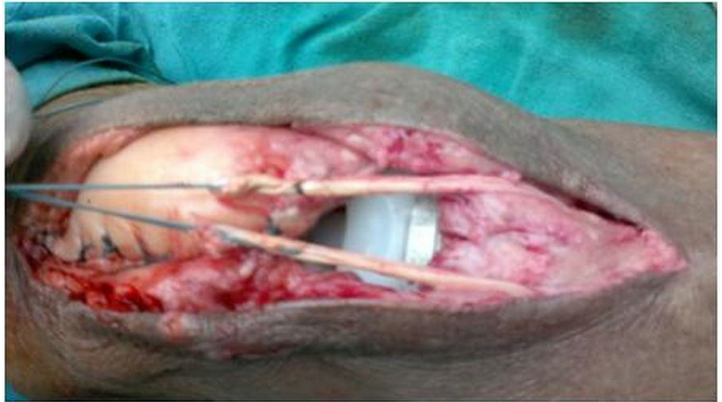
FIGURE 6: Intraoperative picture showing an infrapatellar tendon reconstruction using an ipsilateral hamstring (gracilis) tendon.

A drill hole of 4.5 mm was made through the tibia at the tibial tuberosity level as well as another hole made through the patella in the mediolateral direction. The harvested tendon was passed through these drill holes and sutured back to itself and further anchored to the surrounding soft tissues. An above-the-knee cast was applied for one month followed by physiotherapy exercises. At the six-month follow-up, there was no recurrence of the dislocation and the ROM was up to 100 degrees flexion, but with an extensor lag of 45 degrees (Figure 7).