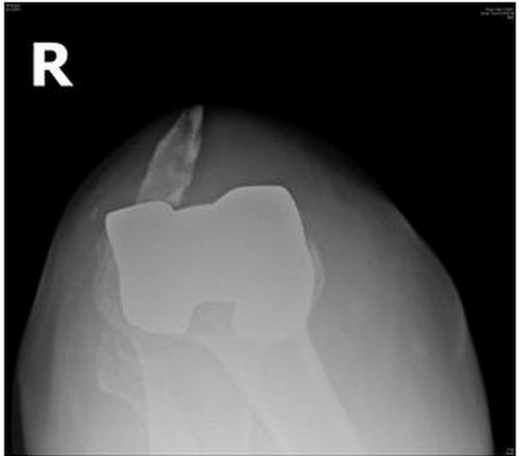
FIGURE 3: Merchant view of a patient showing a lateral patellar dislocation on the right side after TKA.