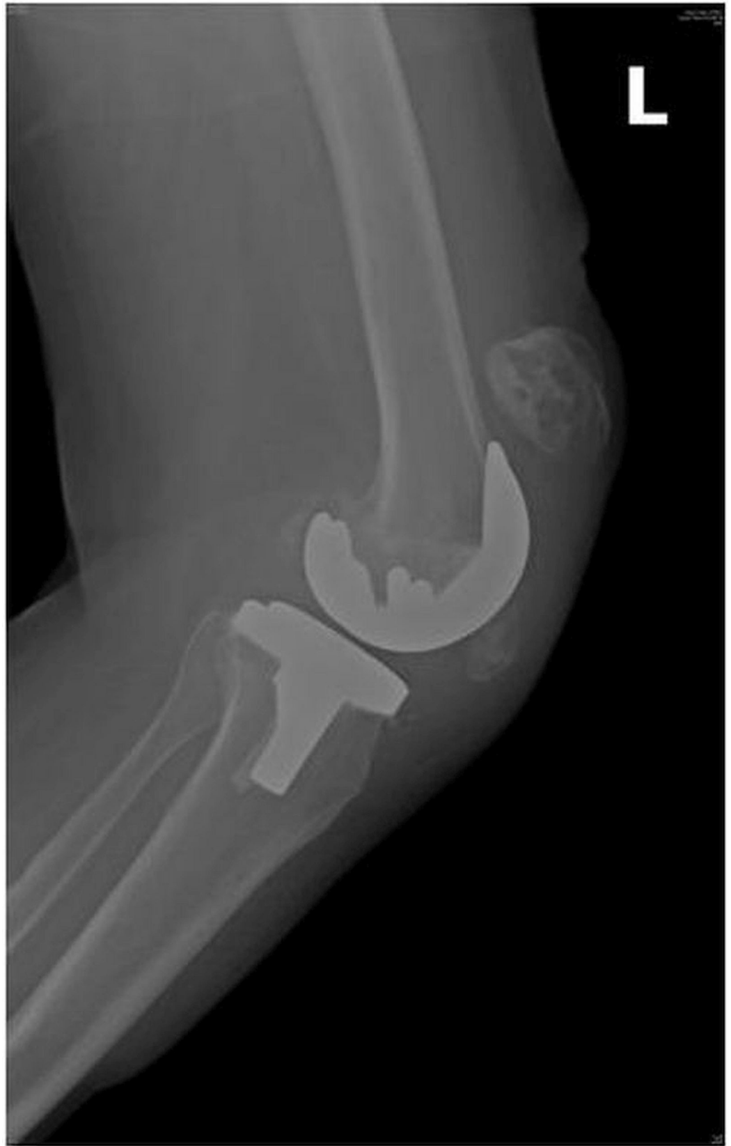
FIGURE 4: Lateral radiograph of a patient showing a patellar fracture on the left side after TKA

Out of 10 knees, five knees had a fractured patella, two sustained infrapatellar tendon ruptures