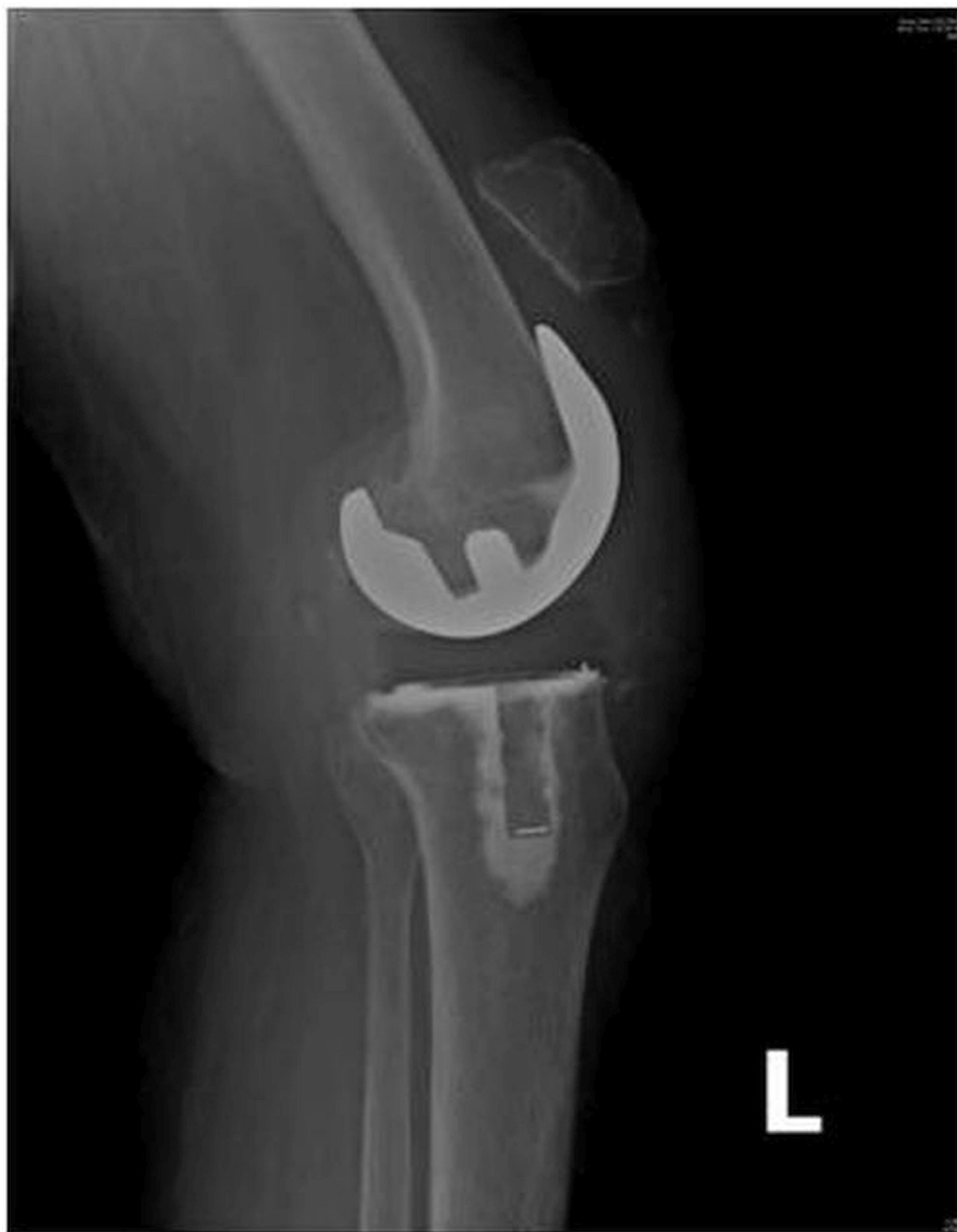
FIGURE 5: Lateral radiograph of a patient showing an infrapatellar tendon rupture and proximal migration of the left patella.

(Figure 5), one developed a lateral patellar dislocation, and the remaining two sustained a rupture of the quadriceps muscle in the suprapatellar region. Seven out of 10 knees were operated upon while three were treated conservatively (Table 1).