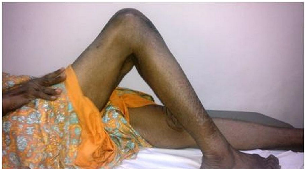
FIGURE 7: Clinical picture at six months follow-up, after infrapatellar tendon reconstruction showing a ROM with up to 100 degrees flexion.

A drill hole of 4.5 mm was made through the tibia at the tibial tuberosity level as well as another hole made through the patella in the mediolateral direction. The harvested tendon was passed through these drill holes and sutured back to itself and further anchored to the surrounding soft tissues. An above-the-knee cast was applied for one month followed by physiotherapy exercises. At the six-month follow-up, there was no recurrence of the dislocation and the ROM was up to 100 degrees flexion, but with an extensor lag of 45 degrees (Figure 7).