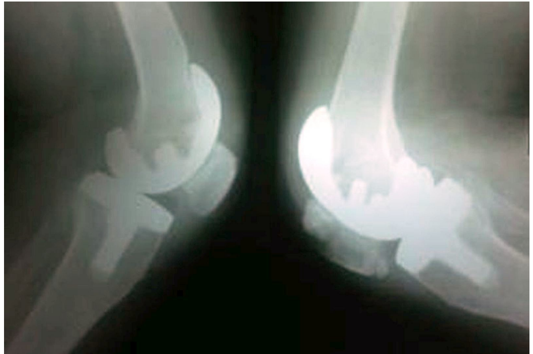
FIGURE 1: Lateral radiograph of a patient with a left patellar fracture three months after total knee arthroplasty

Complications involving the extensor mechanism occur in 1% to 12% of patients following primary TKA. The average age of the patient was 59.6 years (range: 32 - 72 years). There were seven females and two males. One patient had an injury to both the knees. Four patients had rheumatoid arthritis (RA) and five had osteoarthritis (OA) as their primary diagnosis. All the patients were operated using a midline medial parapatellar approach, except one with a severe valgus deformity who was exposed by a lateral parapatellar approach. The average duration of injury since primary surgery was 8.16 weeks (range: 1 - 24 weeks). Most patients have had trivial domestic injuries due to falling on stairs or a floor, injuries due to forceful bending of the knees during exercise, or while sitting down on the toilet. One patient with RA had severe knee stiffness preoperatively with a range of motion (ROM) of 10-20 degrees. This patient sustained a patellar fracture three months postoperatively due to forceful bending of the knee while doing exercises (Figure 1).