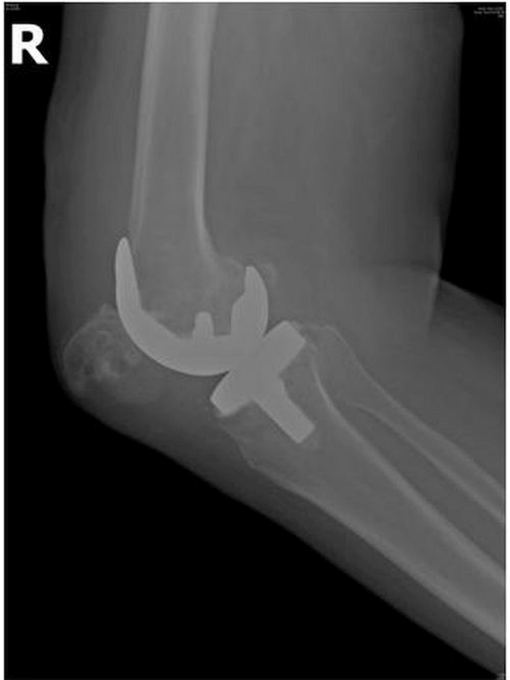
FIGURE 2: Lateral radiograph of a patient showing lateral patellar dislocation on the right side after TKA.