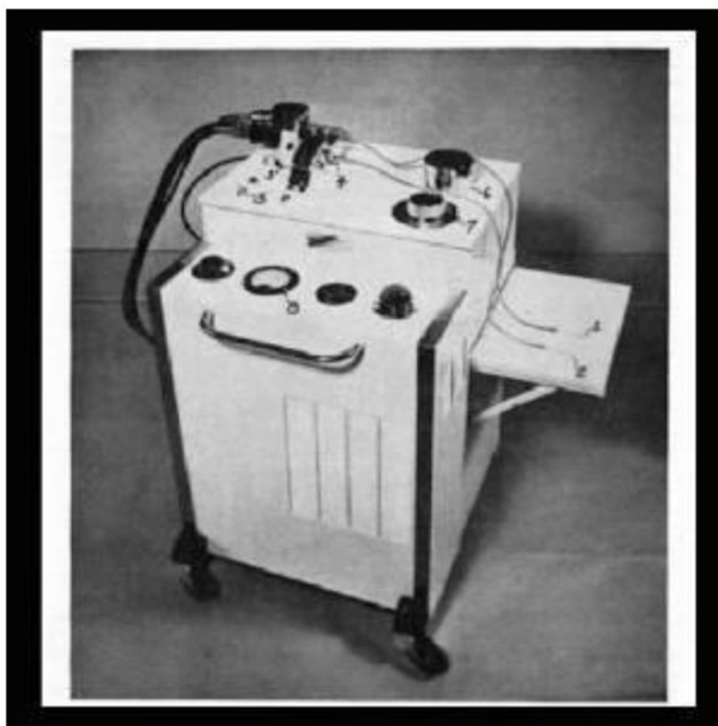
Figure 2. The Knott Hemo-Irradiator.