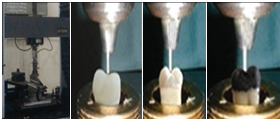
Figure 2: Samples testing under a universal testing machine