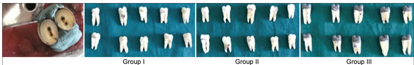
Figure 1: Compound supported matrix and the restored samples

Appropriate reconstruction of the tooth structure is important for the success of good root canal treatment. [4] It has been suggested that placing a post in a root-treated-tooth would pose extra risks to the fracture of the tooth itself. [5] Hence, the Nayyar