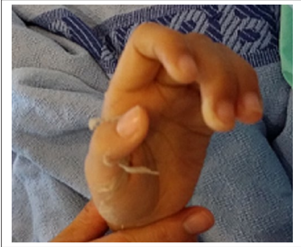
Figure 3. Peeling over the fingers.

Other studies have suggested further laboratory tests to substantiate the diagnosis of Kawasaki disease, such as elevated serum erythrocyte sedimentation rate, 5,6 which was also evident in our patient. She responded well to IVIG and aspirin, which further supported our diagnosis of Kawasaki disease.