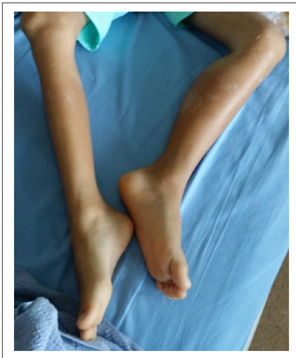
Figure 2. Unilateral, left calf swelling seen.

Kawasaki disease was first described in 1967. It is an acute, self-limiting vasculitis of unknown etiology,