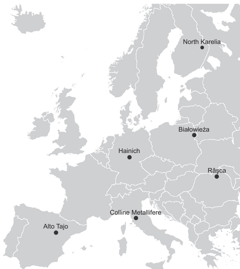
Figure 1. Map showing the location of the six sampling sites in the respective European country. See Table 1 for site and sampling details.

The study was conducted in six mature forest sites (at least in the late to mid-stem exclusion stage) in six countries, spanning six major European forest types (Fig. 1, Baeten et al. 2013). Sampling was conducted over approximately 2 weeks in each of the six countries during the vegetation period (June to August), in either 2012 or 2013. The number of plots sampled varied in each site