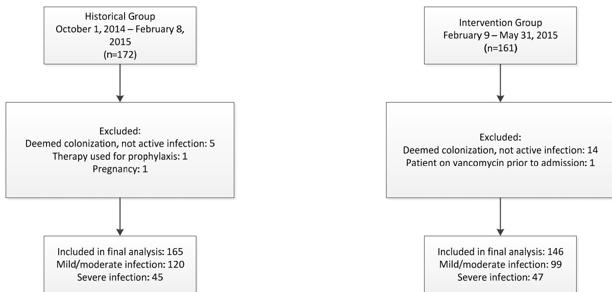
Figure 2. Study participants.

A total of 333 patients were admitted to the hospital with a positive C. difficile NAAT result during the entire study period, with 311 patients included in the final analysis. One hundred sixty-five patients were included in the historical group and 146 in the intervention group (Figure 2). Demographics were similar between groups with the exception of intensive care unit (ICU) admissions upon positive NAAT result, with significantly more patients in the intervention group admitted to the ICU, and patients in the historical group displaying significantly lower albumin levels (Table 1).