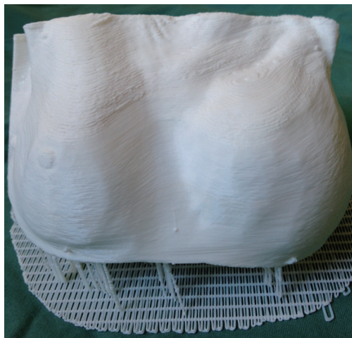
Figure 2 3D printed haptic model of the breasts in Figure 1 using Cube 2 printer (3D Systems, Rock Hill, SC, USA) and polylactic acid (PLA) filaments. Reproduced with permission from Chae et al. (76).

being used widely due to its high cost and lack of published high level of evidence. Recently, interesting advancements and adjuncts to 3D scanning have been introduced, mainly the first web-based 3D surface imaging program, 4D imaging, and 3D printing.