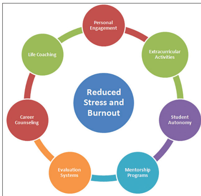
Figure 2: Methods and strategies that help in reducing stress and burnout in preclinical medical students

Students use various coping mechanisms to process stress [Figure 2]. Strategies that involve engagement such as problem solving, positive reinterpretation and expression of emotion, facilitate student adaptation, [2,8,33,43,82] which reduces anxiety and depression and their effects on mental wellbeing [59] and physical health. [82] Extracurricular activities involving music and physical exercise have been associated with decreased stress and burnout levels in preclinical medical students. [43] Unfortunately, few students seek help, [83] and distress often continues into residency and beyond [13] where it may have adverse effects on the quality of patient care delivered. [84,85] Therefore, it is critical for medical